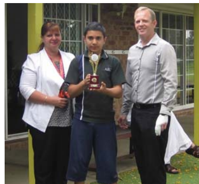
Gotcha trophy won by Years 7-9

That is so cool All about my wonderful high school