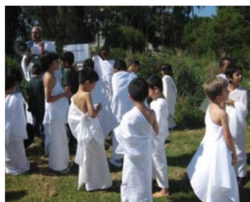
At the Jamarat