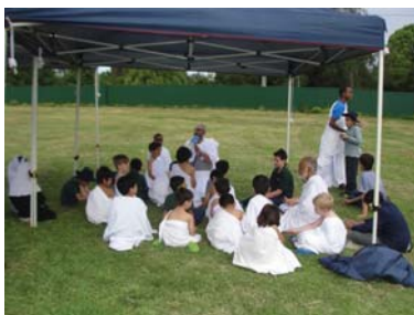
The pilgrims at Mina city