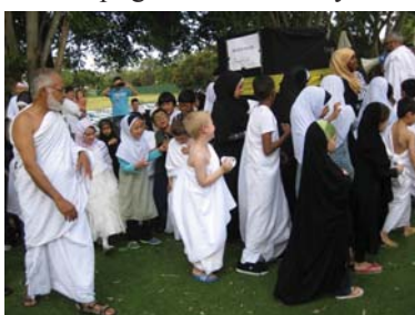
At the Kaaba