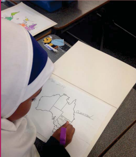
Labeling the map of Australia

This year in History and Geography, the students of year 1 have explored Natural Disasters, Australian History and the countries and continents of the world. We discovered many amazing and interesting facts while engaging within these topics.