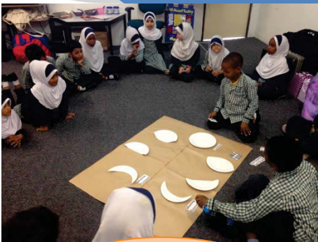
Learning about the phases of the moon as part of our space theme.

In Science, the students of Year 1A have been busy wearing their scientist hats learning all about the WEATHER, OUR SOLAR SYSTEM, THE HUMAN BODY, AUSTRALIAN ANIMALS AND CREEPY CRAWLIES. We had lots of fun exploring these topics found ourselves exploring further into the topics than we had planned.