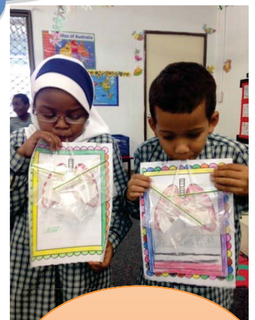
When I breathe, this is how my lungs inflate