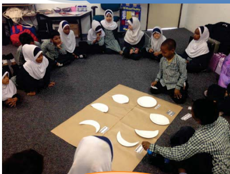
Learning about the phases of the moon as part of our space theme.

In Science, the students of Year 1A have been busy wearing their scientist hats learning all about the WEATHER, OUR SOLAR SYSTEM, THE HUMAN BODY, AUSTRALIAN ANIMALS AND CREEPY CRAWLIES. We had lots of fun exploring these topics found ourselves exploring further into the topics than we had planned.