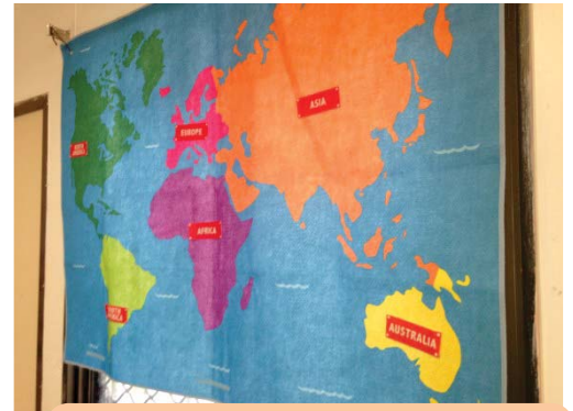
Learning about the countries and continents of the world.

In Science, the students of Year 1A have been busy wearing their scientist hats learning all about the WEATHER, OUR SOLAR SYSTEM, THE HUMAN BODY, AUSTRALIAN ANIMALS AND CREEPY CRAWLIES. We had lots of fun exploring these topics found ourselves exploring further into the topics than we had planned.