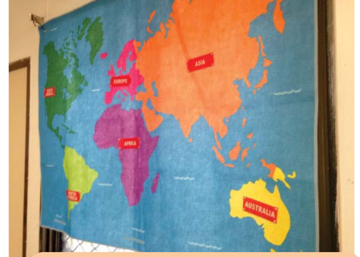
Learning about the countries and continents of the world.

In Science, the students of Year 1A have been busy wearing their scientist hats learning all about the WEATHER, OUR SOLAR SYSTEM, THE HUMAN BODY, AUSTRALIAN ANIMALS AND CREEPY CRAWLIES. We had lots of fun exploring these topics found ourselves exploring further into the topics than we had planned.