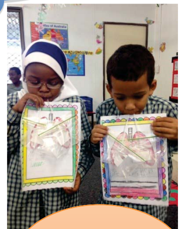
When I breathe, this is how my lungs inflate