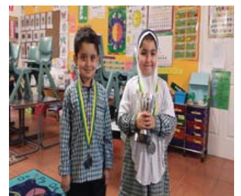
Masha Allah - Quran competition Winners