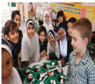
Making jelly was fun