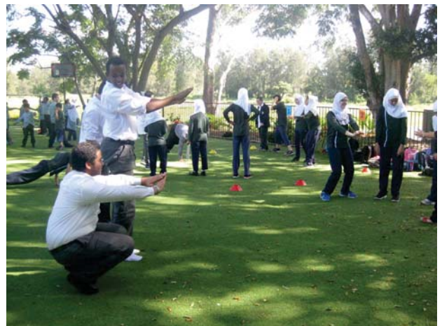
Some stretches before the start of the day

The student have also seen the results of persuasive text through letters we have sent out to different sporting organisations requesting assistance to improve our sporting equipment for our Health and Physical Education programs. Many organisations have been generous enough to donate sports equipment to the school, offers of free sports training, as well as other equipment and lessons at discounted prices. We are currently reviewing the offers to benefit all of our students in the school.