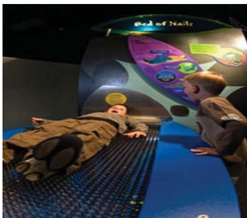
Brisbane Queensland Museum

We are excited about our new class and some new friends who has joined us at the beginning of this term. Most excited to be with our old friends from Prep class last year. This term we are learning so much about who we are, where we come from and special traditions that we have. We are also learning about healthy eating and how important it is to look after ourselves. As part of our learning, we are excited to tell you that Prep and Year 1 classes will be visiting the Brisbane Museum on the Thursday 12 th March. This is exciting for us as we will be extending our learning about our "Five Senses" and other educational programs suitable for our learning needs.